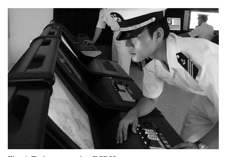
Fig. 6. Trainee operating ECDIS

It is important that training is carried out on one type of the system for all the trainees. During the course, trainees are often inclined to share their discoveries and solutions when trying to perform a new task. This exchange would be limited if some trainees had one type of ECDIS and others in the same class had another. That prospect would likely be overly taxing to the trainer, as well. Another point here is that it is really impossible to teach "ECDIS in general". Proficiency with complex equipment is a specific task. What can be emphasized to trainees who expect to find a different brand of ECDIS on board ship is that, thanks to the type-approval process, basic functions will be available even if the Officer faces a different user interface or menu structure from another manufacturer.