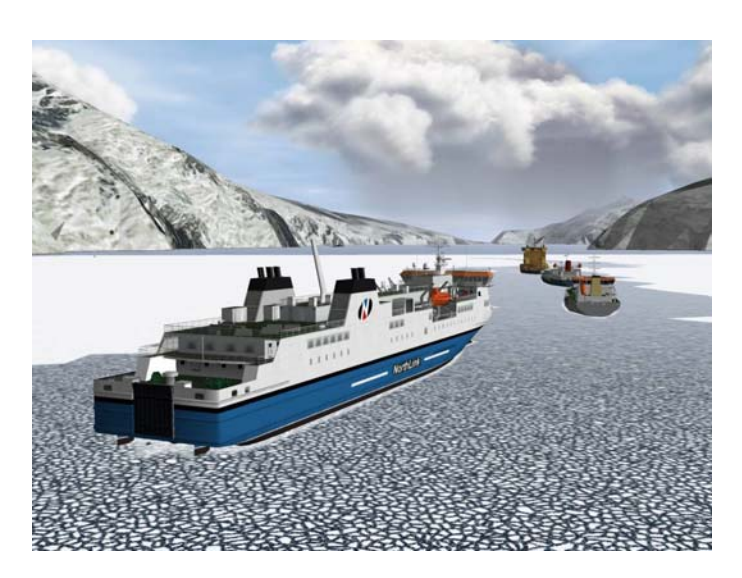
Fig. 3. Visualisation in Transas NTPro (ice conditions)

ECDIS can be installed on the simulated bridge as Master and Back Up station, while Instructor's workplace can include Slave station to observe trainee's behavior online; supervise his actions and