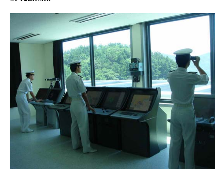
Fig. 2. ECDIS Training with Transas NTPro 4000

The ECDIS Training can be carried out on the Transas navigational simulator Navi-Trainer Professional 4000 (NTPro) which include real ship controls or with the use of computer programs suitable for shipboard training (CBT). The real electronic chart system included in the simulator allows familiarization with all the details of electronic chart operation, including route generating and editing, electronic chart updating and principles of displaying various information. The scenarios for training are located in the fictitious sea. Situations, functions and actions for different learning objectives occurring in different sea areas, can be integrated into one exercise and experienced in real time. This gives the ability to produce the greatest impression of realism.