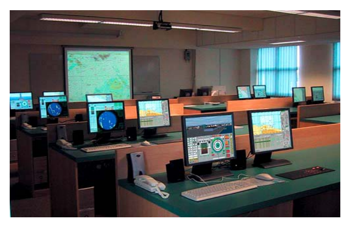
Fig. 1. ECDIS Class

The ECDIS Training can be carried out on the Transas navigational simulator Navi-Trainer Professional 4000 (NTPro) which include real ship controls or with the use of computer programs suitable for shipboard training (CBT). The real electronic chart system included in the simulator allows familiarization with all the details of electronic chart operation, including route generating and editing, electronic chart updating and principles of displaying various information. The scenarios for training are located in the fictitious sea. Situations, functions and actions for different learning objectives occurring in different sea areas, can be integrated into one exercise and experienced in real time. This gives the ability to produce the greatest impression of realism.