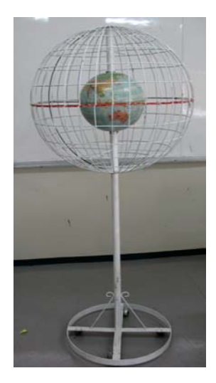
Fig. 3. White Celestial Sphere with Globe at its Center