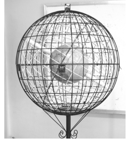
Fig. 4. Combined Blue and White Celestial Spheres