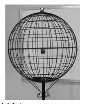
Fig. 2. Blue Celestial Sphere

There are two major parts of the instructional tool: the blue Celestial Sphere (Figure 2) and the white Celestial Sphere enclosing a globe in its center (Figure 3). Using the blue sphere, topics about the Horizon system of coordinates such as Zenith, Nadir, Altitude, Zenith distance, Azimuth, Point on the horizon, Prime vertical circle, Principal vertical circle, Vertical circles, and Altitude circle or parallel of altitude are easily conveyed to the students. On the other hand, with the use of the white sphere, Time Diagram, Celestial Equator system of coordinates, and Terrestrial System of coordinates are better communicated with the students compared with just using one-dimensional drawings of spheres. Lessons on Time Diagram include Hour circles, LHA, GHA, SHA, RA, Meridian angle, Meridian passage, and Longitude); on Celestial Equator system of coordinates involve Hour circle, GHA, LHA, Meridian angle, Declination, Polar distance, Diurnal circle or parallel of declination, Nocturnal arc, Celestial poles and Celestial equator, and; on Terrestrial System of coordinates are Terrestrial poles, Equator, Meridians, Greenwich meridian, Geographical position of the body, and the equivalence of the its components to the celestial system's components. Eventually, the blue and white spheres are combined to illustrate concepts of Meridian passage, Circumpolar bodies, Polar distance, Zenith distance, Co-latitude, and finally the composition of the Navigational Triangle. See Figure 4.